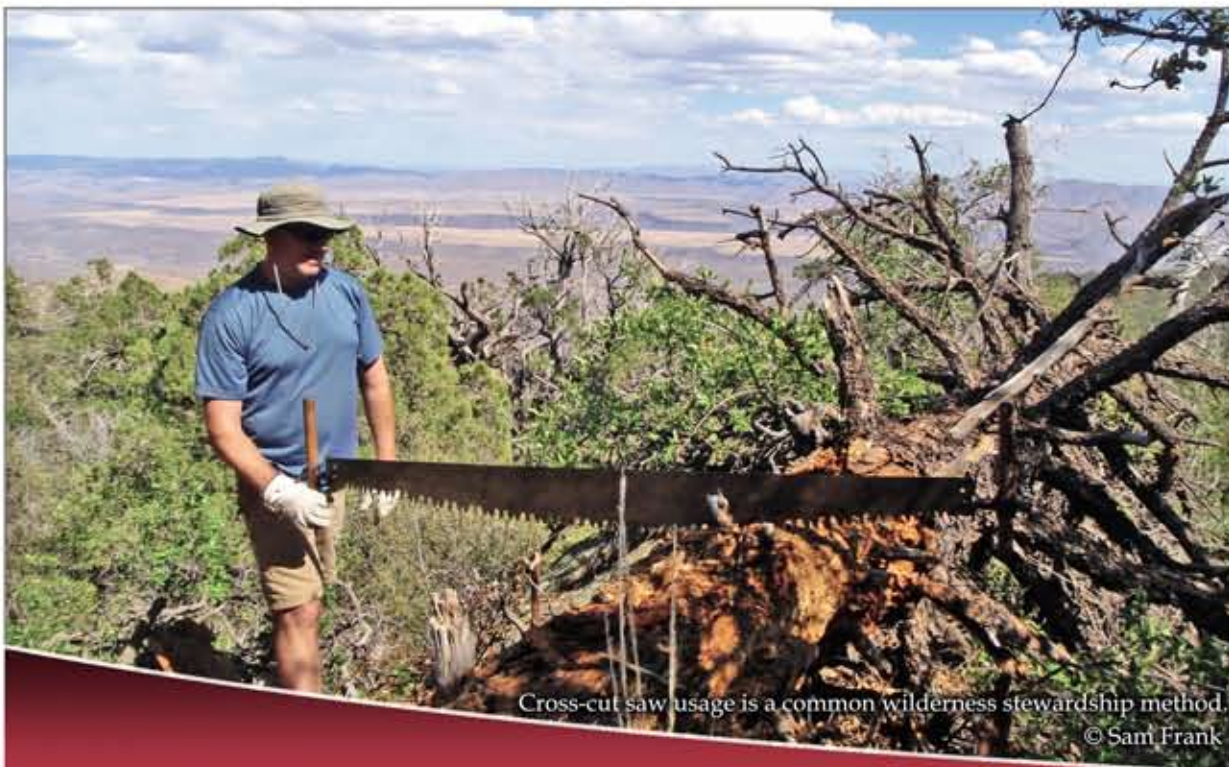
Cross-cut saw usage is a common wilderness stewardship method.